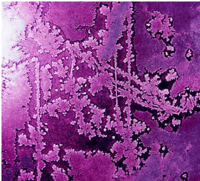
Front Door Frost

“ The Pot Of Gold ” is a monthly publication created by Molly Rowland. Graphics by Dorian Zumwalt. If you would like to advertise in “The Pot of Gold” ads are $10 per month for up to six lines and $2 per line after that. Contact us: vog@wbaccess.net or 307-335-8113