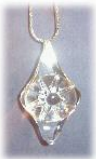
Shield of Genesis

This month are two tools that will help protect you and help you fill-in energy where there is a void (ie cash).